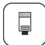
TCP / IP