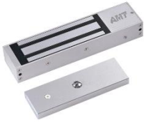
EM Lock 600LBS