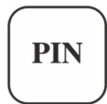
Personal Identity Number