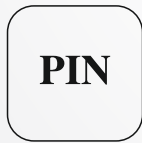
Personal Identity Number